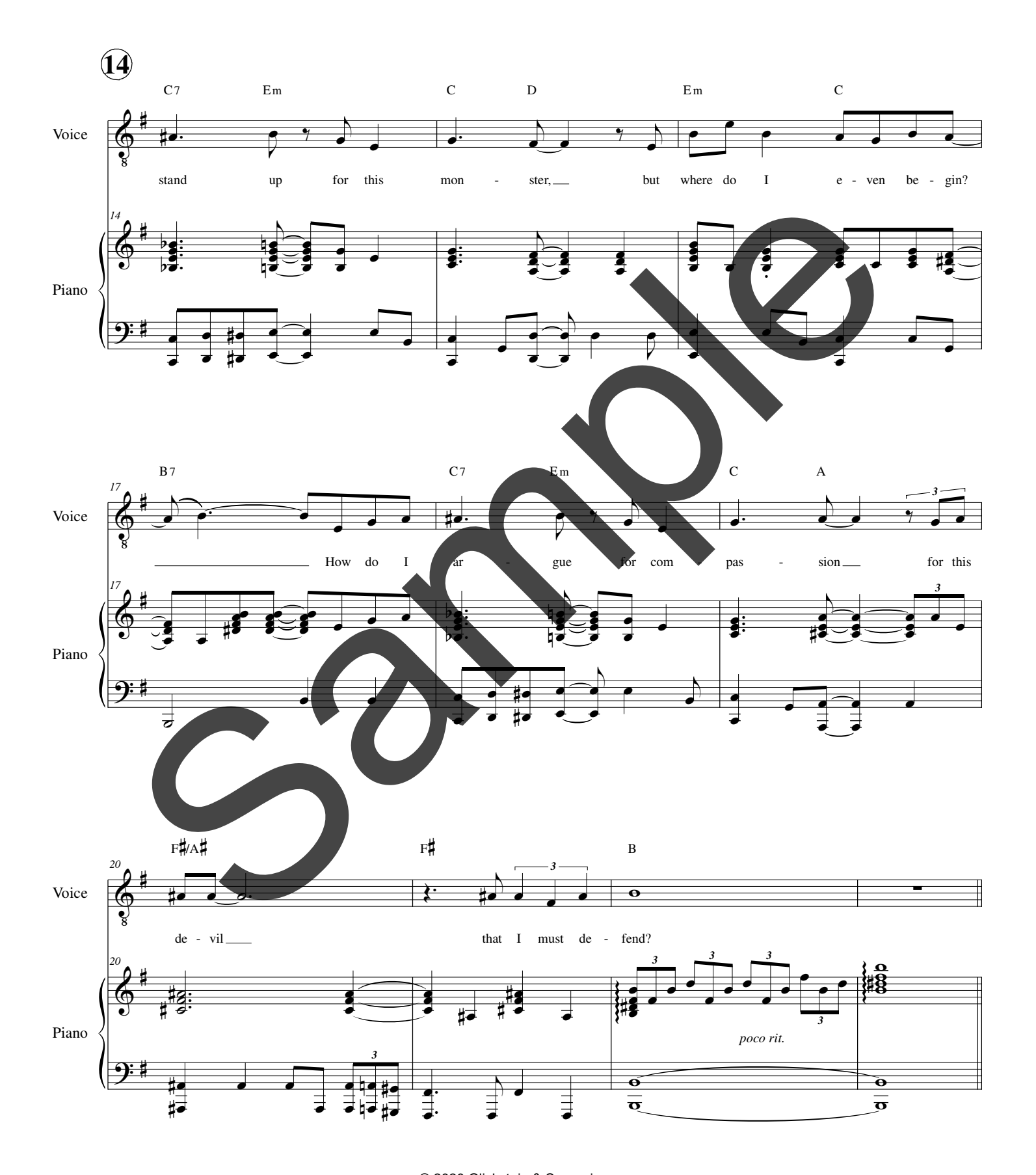
© 2020 Glickstein & Spraggins All Rights Reserve